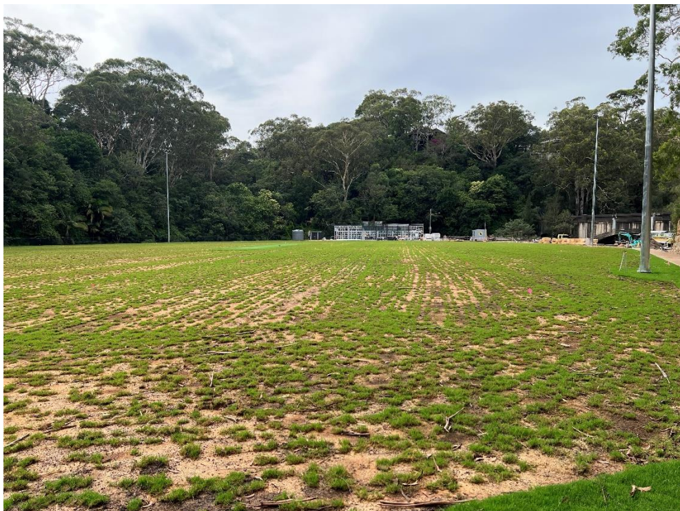
Figure 2: Bob Campbell Oval on 3 December 2025

The remainder of project is progressing as planned and is expected that the oval will be ready for public use by July 2025, however an assessment of a staged release to the public of the completed works in the reserve will be made early in the new year, when they can be safely accessed by the public. The project is currently on time and on budget.