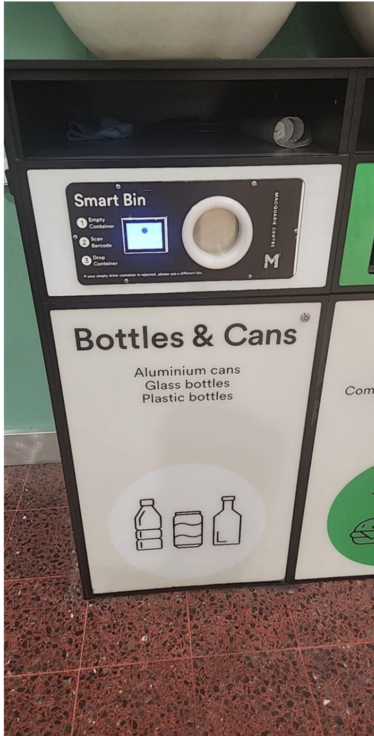
Smart Bin Bottles and Cans at Macquarie Shopping Centre (example of a current smart bin system in use).