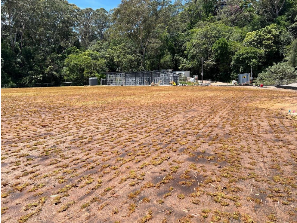
Figure 1: Bob Campbell Oval on 25 November 2025